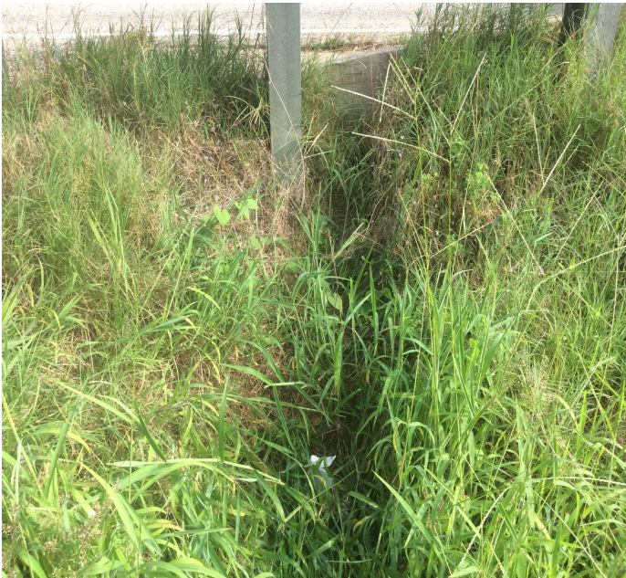
PHOTO 1 Description Approach roadway west end , south erosion to end slope.